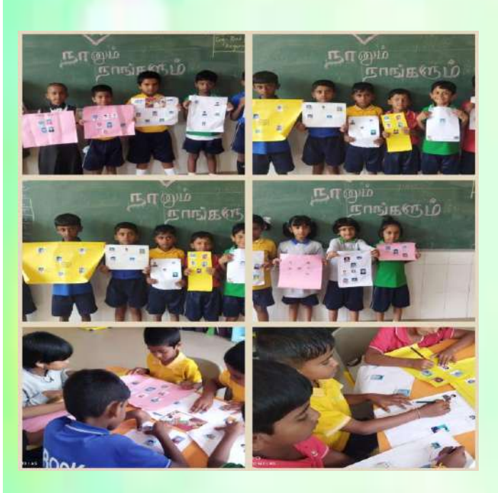
"Me & My Family"