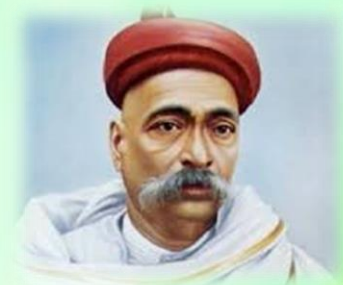
Lala Lajpat Rai

He was leading a silent protest against the Simon Commission in Lahore when he was brutally lathi-charged by Superintendent of Police, James Scott. Rai died of injuries sustained a few weeks later. Bhagat Singh and a few other revolutionaries vowed to take revenge for Rai's death and plotted to kill Scott. But he shot and killed John Saunders, an Assistant Superintendent of Police in a case of mistaken identity.